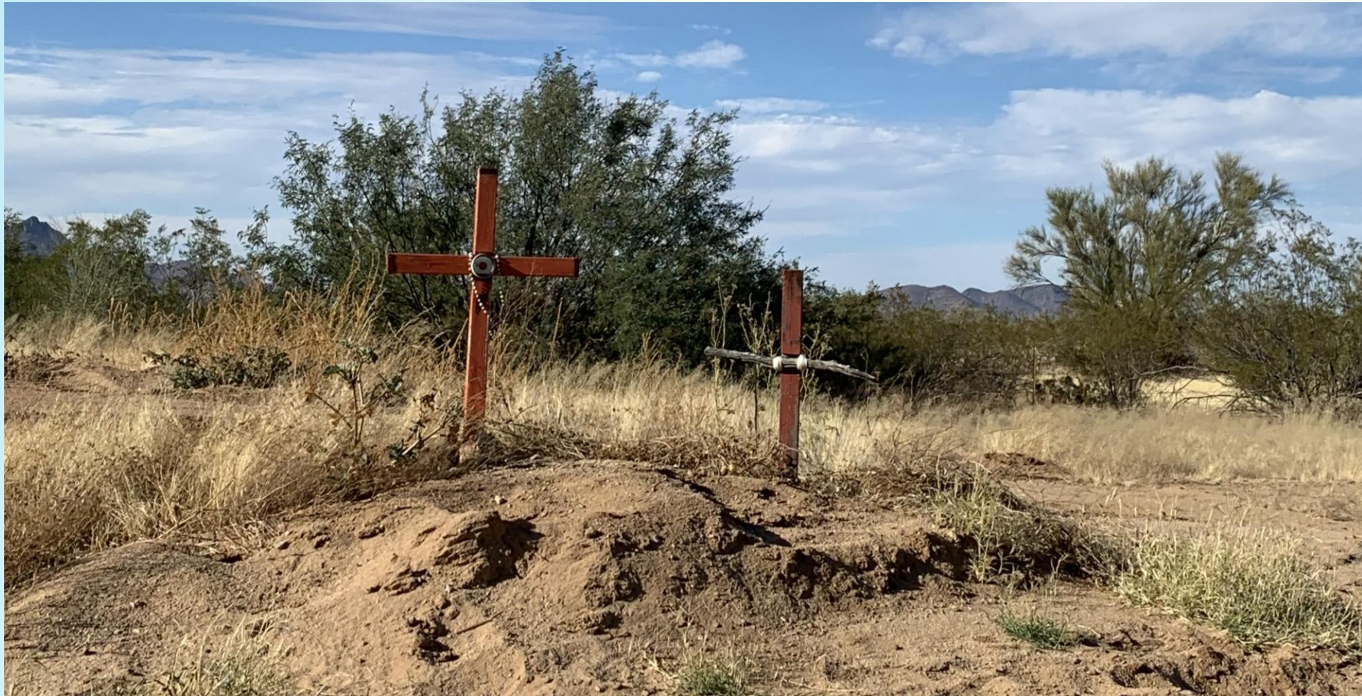
Two crosses Álvaro Enciso placed to honor migrants who died.